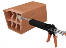
Inject the resin.